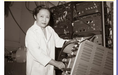
Chein-Shiung Wu Ph.D.