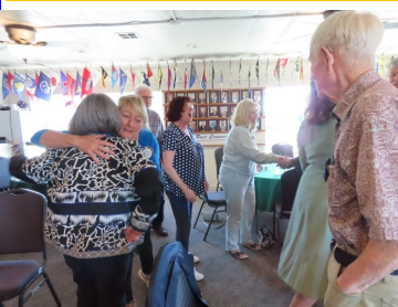
Hugs and handshakes